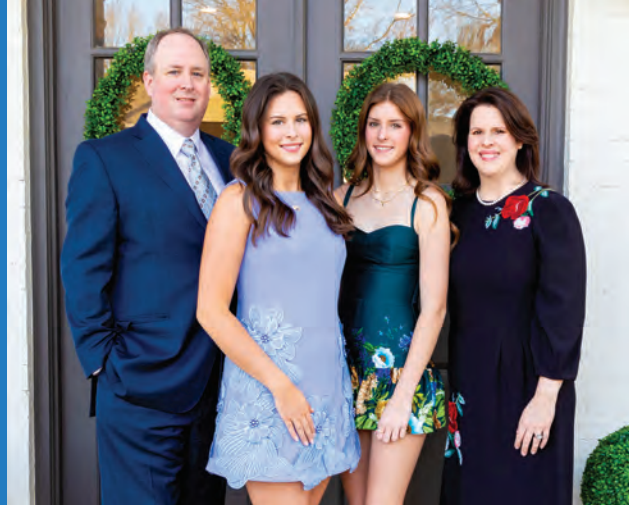
The Malone Family