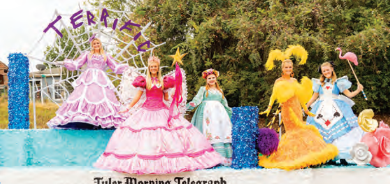
Tyler Morning Telegraph