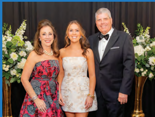
The Ballard Family