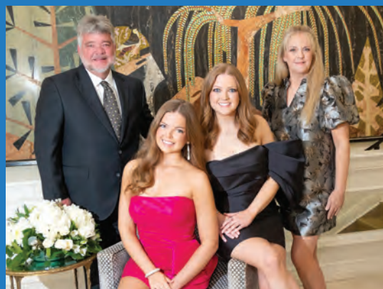
The Brewer Family